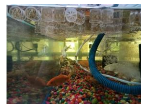
Aquarium with self-cleaning system after 3 months (with normal fish feeding)