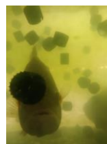
Aquarium after 20days (normal fish feeding & algal growth)