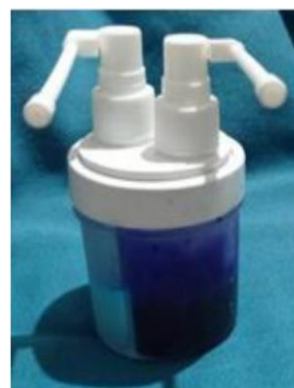
Dual Chamber Sprayer

The present invention relates to a novel process of synthesis to obtain the purest possible Toluidine blue O so that the colour value can be accentuated. The present invention also relates to a formulation with TBO as the chief ingredient to increase the stability and clinical effectiveness. The present invention further relates to a dual chamber sprayer where one chamber contains this unique formulation of TBO and another chamber contains flavoured acetic acid for convenient intraoral topical application. In addition to screen oral cancer with 93.65% sensitivity and 100% specificity, this kit can also aid in identifying appropriate biopsy site in a large oral ulcer. This sprayer contains two separate chambers, one contains TBO formulation and another contain 1% flavoured acetic acid which shall deliver these two solutions in three steps as topical applications onto the oral mucosa. Bluing detects oral cancer. This kit is user friendly, convenient cost effective having higher clinical effectiveness which would be useful not only at every dental clinic but also at every mass screening camp.