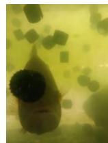
Aquarium after 20days (normal fish feeding & algal growth)