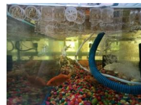
Aquarium with self-cleaning system after 3 months (with normal fish feeding)