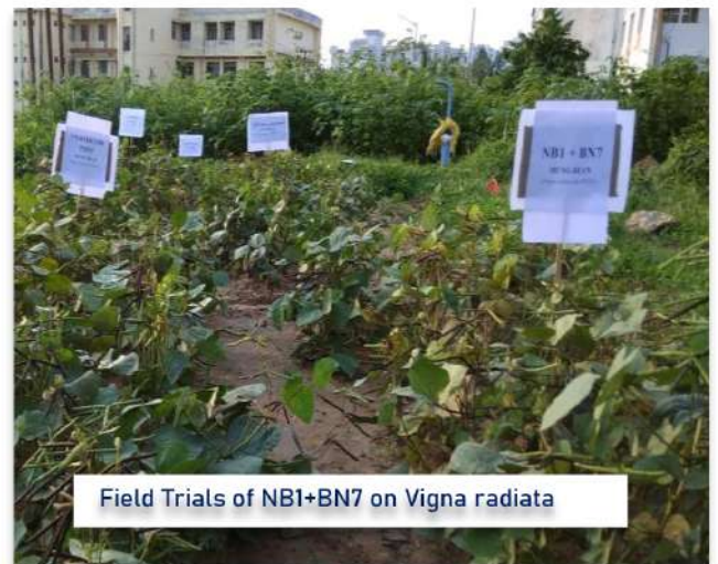
Field Trials of NBI+BN7 on Vigna radiata