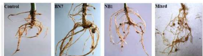
Average No. & Pattern of Root Nodules