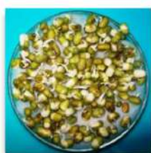
Vigna radiata Sprouting