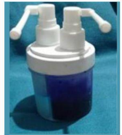
Dual chamber Sprayer