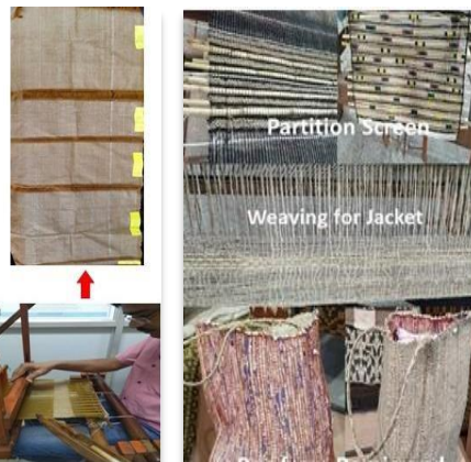
Fig. Handloom Products